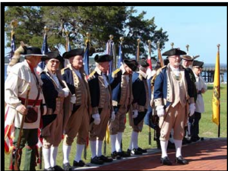
The Georgia Society Color Guard ready to present the Colors at Patriots Day St. Simons Island, Georgia