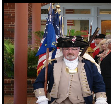
The Georgia Society Color Guard presented the Colors at Patriots Day St. Simons