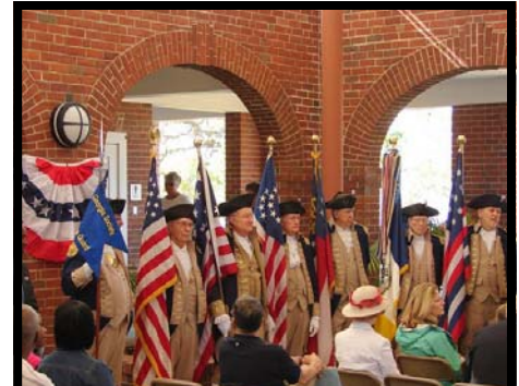
The General James Oglethorpe CAR Society led the Pledge of Allegiance Patriots Day St. Simons