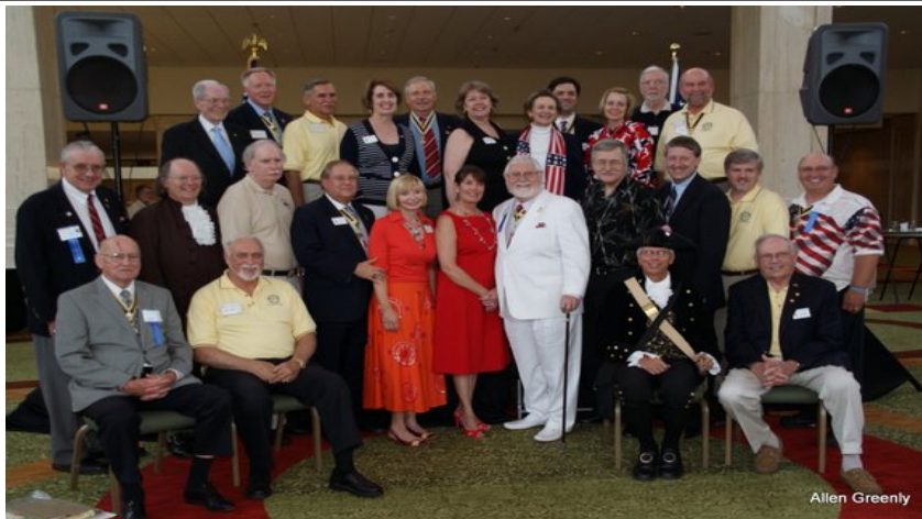
Readers of the Declaration of Independence at the 2009 Annual Congress